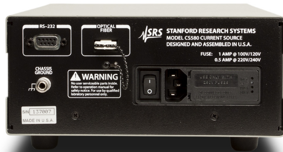
CS580 rear panel