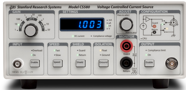
CS580 front panel

For remote interfacing with complete electrical isolation, the CS580 also has a rear-panel fiber optic interface. When connected to the SX199 Remote Computer Interface Unit, a path for controlling the CS580 via GPIB, Ethernet, and RS-232 is provided.