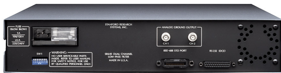
SR640 rear panel