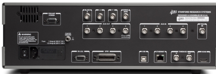
SR865A rear panel