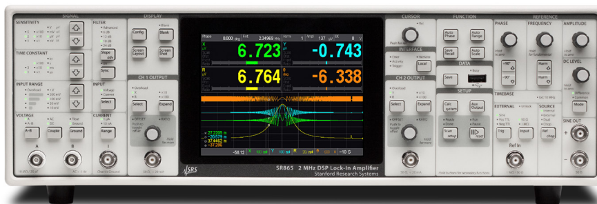
SR865A front panel