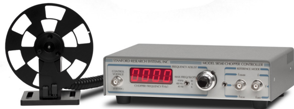
SR540 Optical Chopper

Synchronous filtering may also be selected at reference frequencies below 4 kHz. The synchronous filter notches out multiples of the reference frequency and is extremely useful in making low frequency measurement where multiples of the reference frequency would otherwise show up in the lock-in output. Unlike previous designs the synchronous filter in the SR865A can be selected with no loss of output resolution.