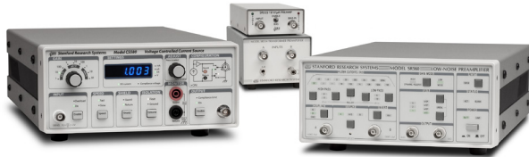
SRS current source and several SRS preamplifiers

The SR865A's built-in current amplifier represents a significant improvement over previous designs. The current input range is selectable from 1 \mu A or 10 nA. The 1 \mu A range has 400 kHz of bandwidth and 130 fA/ \sqrt{\text{Hz}} of noise, while the 10 nA range offers 2 kHz of bandwidth and 13 fA/ \sqrt{\text{Hz}} of noise.