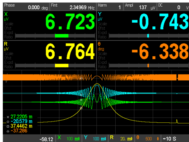
Large numeric readout with strip chart recording

The SR865A's effective dynamic reserve is simply the ratio of these two settings. For instance with a 10 nV sensitivity setting and a 300 mV input range the effective dynamic reserve of the SR865A is 3 \times 10^7 , or nearly 150 dB.