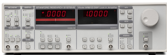
SR810 DSP Single Phase Lock-In Amplifier