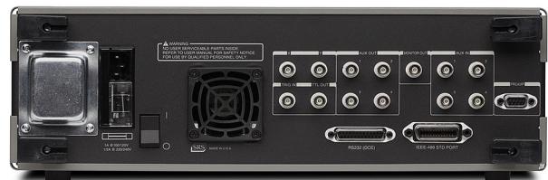
SR810/830 rear panel