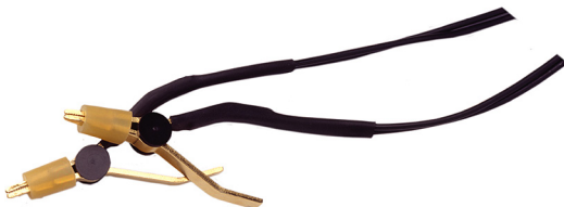
SR726 Kelvin Clips

The SR715 and SR720 support three types of binning schemes: pass/fail, overlapping and sequential. Pass/fail has only two bins: good parts and everything else. Overlapping (or nested) bins have one nominal value and are sorted into progressively larger bins (e.g., \pm 1\% , \pm 2\% , \pm 3\% ). Sequential