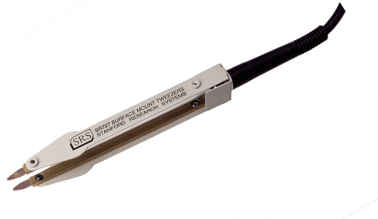
SR727 Surface Mount Tweezers

The SR715 and SR720 have a kelvin fixture which uses two wires to carry the test current and two independent wires to sense the voltage across the device under test. This prevents the voltage drop in the current carrying wires from affecting the voltage measurement. Radial components are simply inserted into the test fixture, one lead in each side. Axial devices require the use of the axial fixture adapters (provided). Surface-mount devices, or components with large or unusually shaped leads, can be measured with optional SMD Tweezers (SR727) or Kelvin Clips (SR726). The tweezers and clips attach directly to the LCR meter's front-panel test fixture. An optional BNC Fixture Adapter (SR728) allows you to connect a remote fixture or other equipment through one meter of coaxial cable.