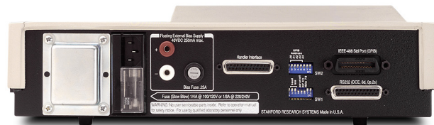
SR720 rear panel

Two rear-panel input connections are provided for an external bias voltage. Voltages as high as 40 VDC can be used. An optional handler interface provides control lines to a component handler for sorting. A standard RS-232 interface allows complete control of all instrument functions by a remote computer. A GPIB interface is included with the handler option.