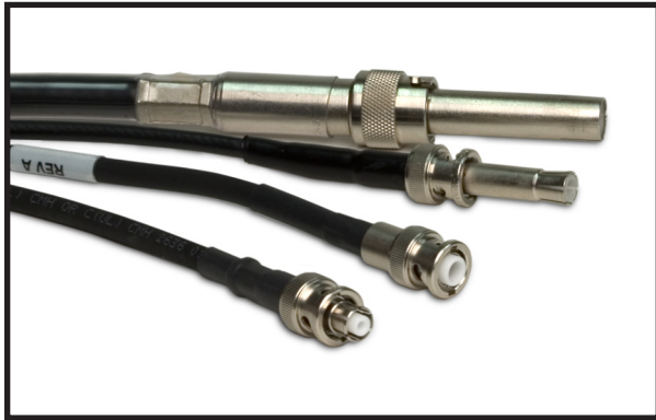
High voltage cables

The PS300 Series High Voltage Power Supplies are as useful in the R&D lab as they are in automated test applications. Wherever you are using them, the PS300 Series provide proven reliability and performance at a very affordable price.