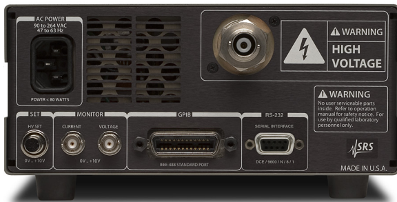
PS370 rear panel

Both GPIB and RS-232 computer interfaces are standard on all 10 W supplies. GPIB is available as an option on the 25 W instruments. All parameters can be set and read via the computer interfaces.