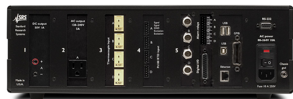
PTC10 rear panel

Macros are a powerful tool that can be used to tailor the behavior of the PTC10 for your experiment. For example, infinite-loop macros running as background tasks can take steps to address alarm conditions, automatically switch between sensor inputs (or heater outputs) depending on the current temperature or other factors, or implement cascade feedback schemes.