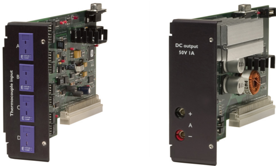
PTC330 Thermocouple Card PTC430 DC Output Card

isothermal block, with its own RTD temperature sensor, provides highly accurate cold junction measurements.